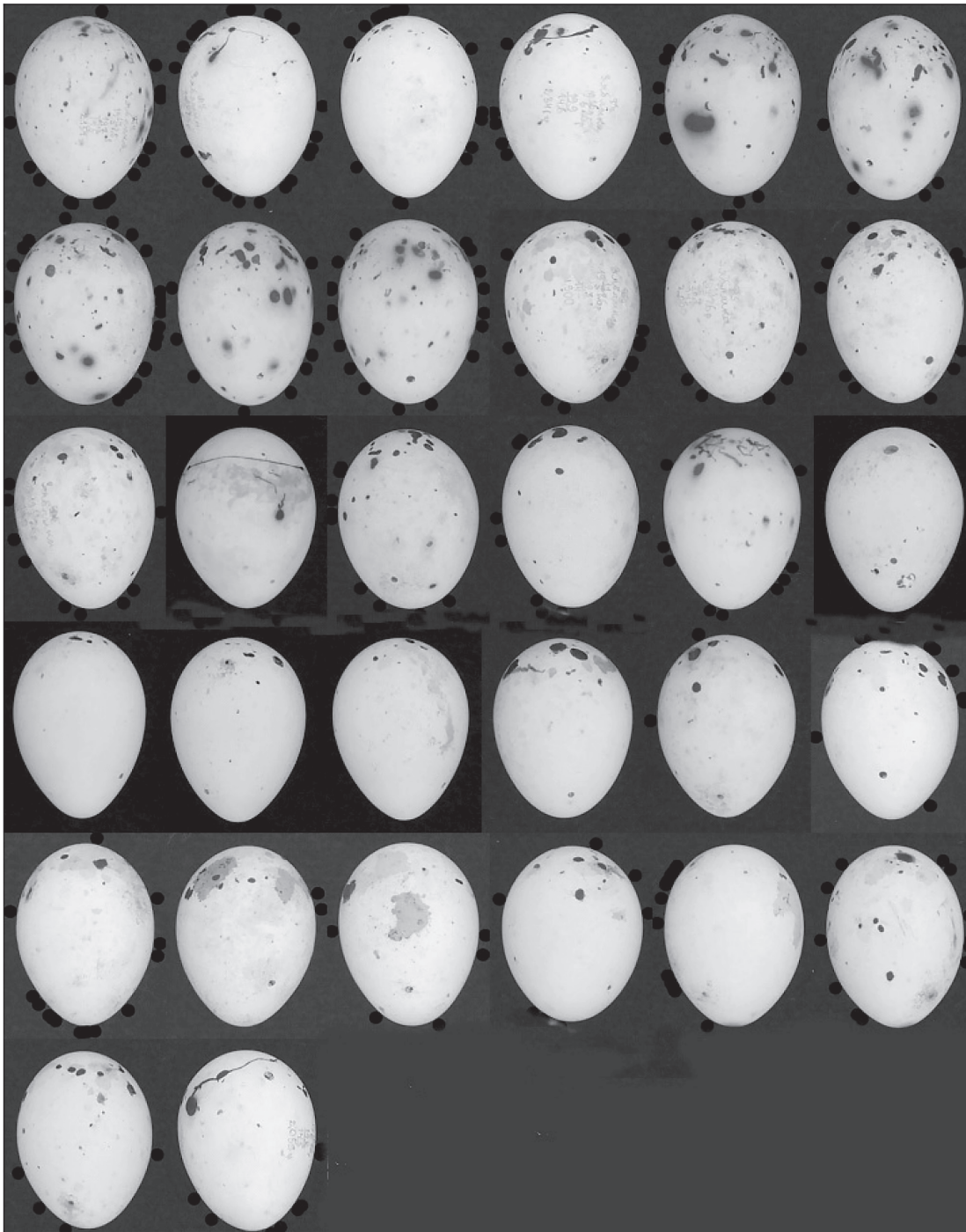
Figure 3. A collection of eggs of Fringilla coelebs Linaeus, 1758

cal) end (clo); a pattern placed evenly (even); pattern elements placed on both the blunt and sharp ends (info/clo); a pattern forms a belt in the equatorial zone (equat) (Mytiai, 2008).